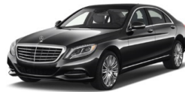
MERCEDES S CLASS, BMW 7, AUDI A8