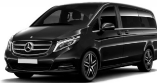
MERCEDES V CLASS

With unlimited mileage included for no extra cost, complimentary drinks including coffee and water as well as fruit snacks available on every vehicle stocked daily by our team members who are committed to providing transparency throughout each process—you can rest easy knowing they're working hard every day, so you don't have to.